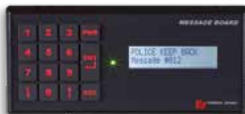
Control head enables the operator to activate the LED message board with tactical push-button control.

MB1 models have pre-programmed messages or custom messages can be created using PC based software. A name of up to (20) characters can be assigned to each programmed message. The message displayed across the message board will also display across the control head. Using the message based software, programmed messages can also be copied to other vehicle message boards.