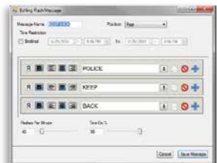
Customize messages are created and named using a PC based software.