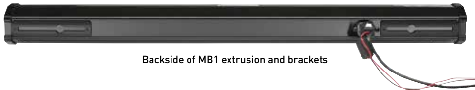
Backside of MB1 extrusion and brackets