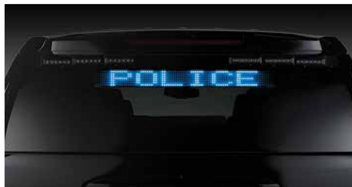
MB1 mounted on a Ford Interceptor Utility