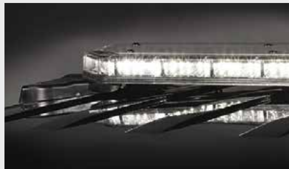
Low Profile hook mount