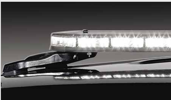
Standard hook mount

The low hook mount option allows the body of the light bar to be approximately 5/8 of an inch lower than the standard hook mount, depending on the specific vehicle make and model